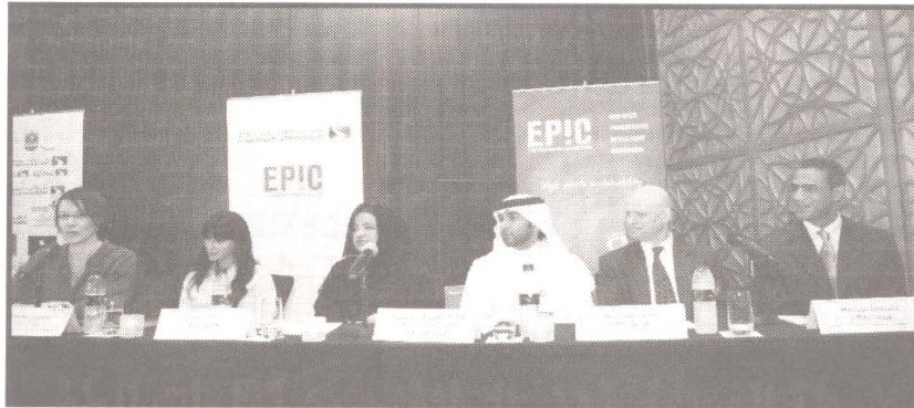
خلال الإعلان عن استضافة المعرض الدولي