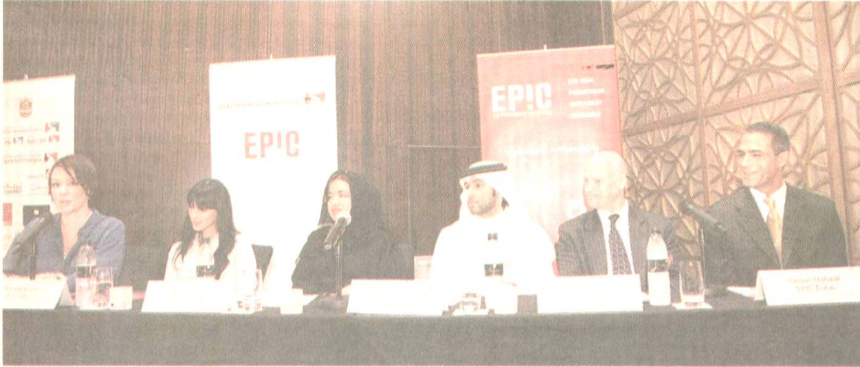
خلال الإعلان عن المعرض