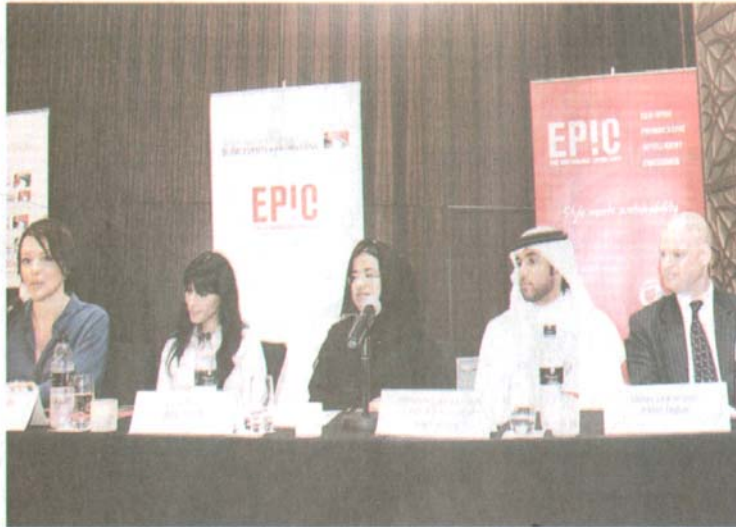
Officials during the press conference on Tuesday.

"The EPIC expo includes a variety of showcases to satisfy all tastes and interests of people